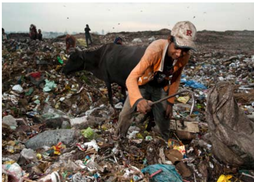
Dummy caption needs to change

But no one considered informal workers who were al-